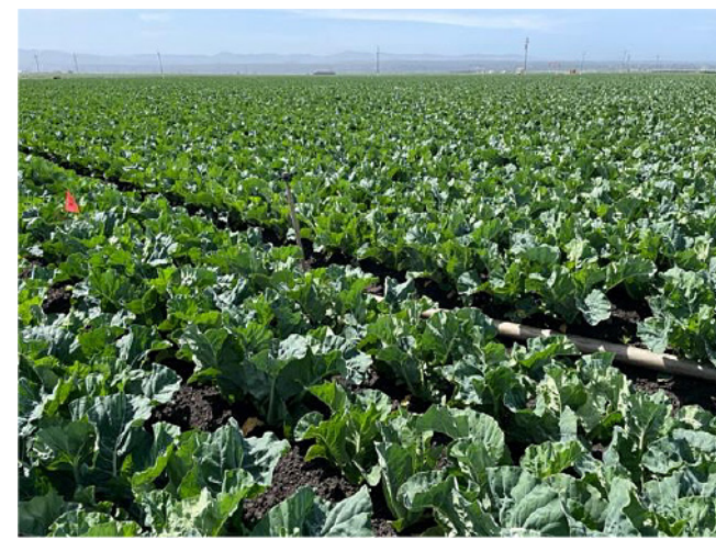
In Field (2 applications combined with Grower Std.)