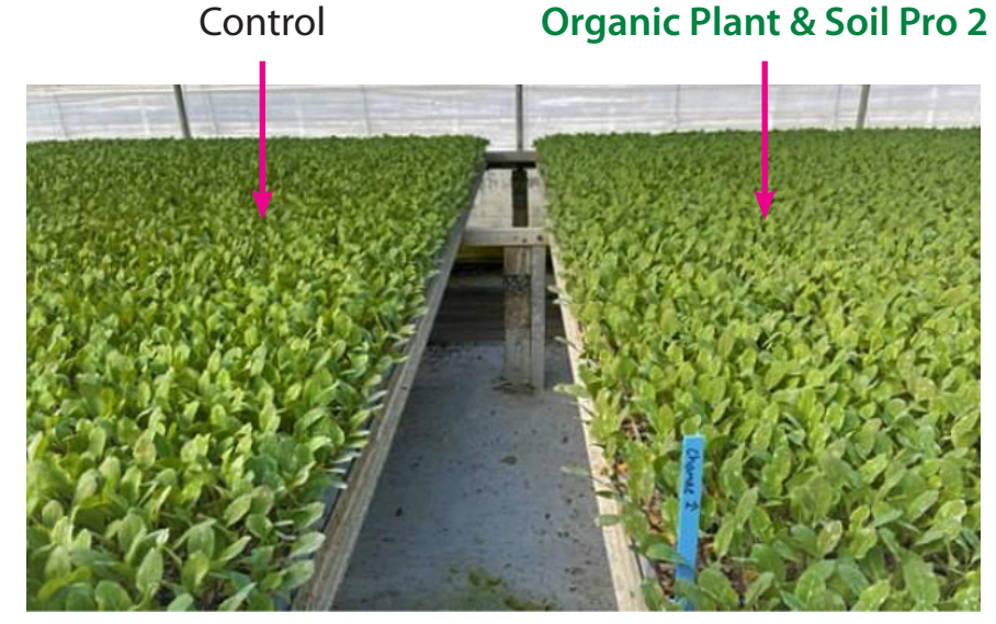
In Nursery (7 applications combined with Grower Std. Program in nursery)